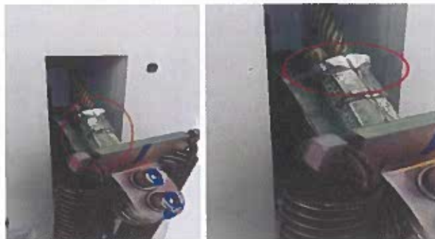
Figure 1. Crimped terminal of steel cable

Philips has not received any reports of this issue or harm as of April 2024.